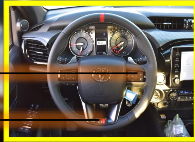
LEATHER STEERING WHEEL WITH MOUNTED GR LOGO