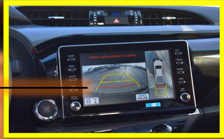
360 DEGREE CAMERA